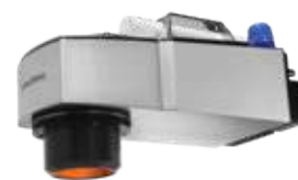
DA 7440 On-line NIR

The DA 7250 is supported by the NetPlus web-based cloud solution. Instruments are connected through a local network or internet and can be accessed from anywhere through a web browser interface. NetPlus Reports provides access to analysis results and lets you monitor production or quality and provides the latest analysis results in graphs or charts. Monitor production, verify quality of ingredient shipments, or get an update on the latest analyses. NetPlus Remote lets you configure instruments, monitor performance, and update calibrations. Whether you manage one instrument or a NIR network of a hundred instruments, NetPlus Remote streamlines your tasks.