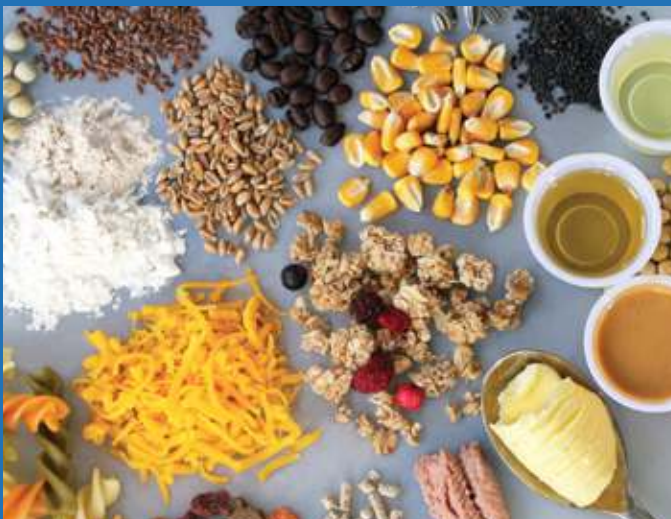
MOISTURE, PROTEIN, FAT, FIBER, STARCH, ASH, SOLIDS, AND MORE