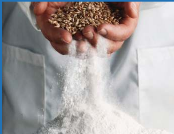
RAW MATERIALS, PROCESS SAMPLES, AND END PRODUCTS