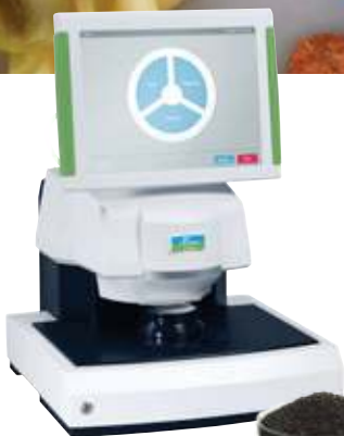
DA 7250™ Diode Array NIR Analysis System