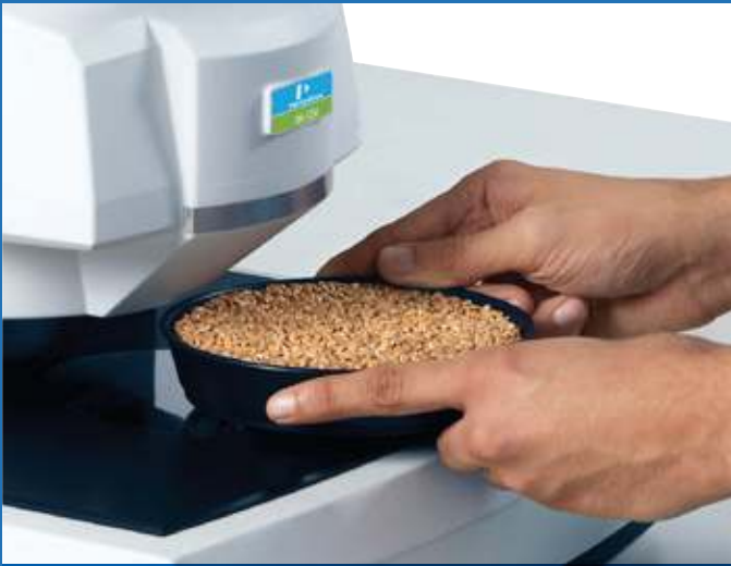
EASY TO USE – OPEN DISH ANALYSIS