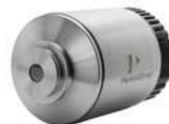
DA 7350 In-line NIR