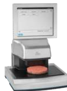
DA 7250 SD At-line NIR