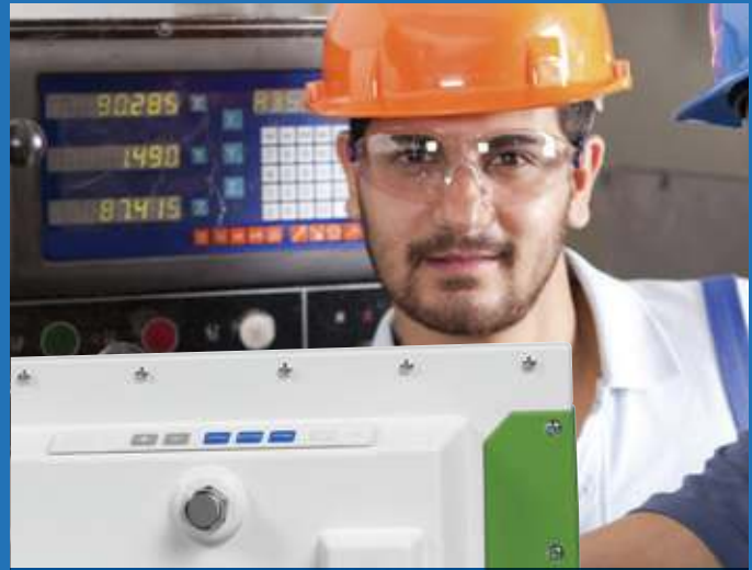
ROBUST AND NO MOVING COMPONENTS IN SPECTROMETER