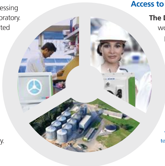
The DA 7250: convenience to analyze anywhere

The DA 7250 is fast. With an optimized workflow and little-to-no sample preparation, test samples anytime in just a few seconds. Samples can essentially be analyzed in real time, and results are available online, 24/7 with NetPlus Reports software.